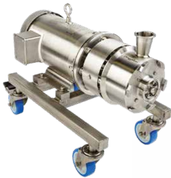
Production size models shown: DS-425, DS-850

The Dynashear represents the latest technology for high shear, inline continuous processing, or batch processing with recirculation. The Dynashear will mix, dissolve, deagglomerate, disperse, and emulsify a wide range of fluids and semifluids, and is particularly effective for wetting out powders into a liquid. It features a first-in-class tandem head design combining the benefits of both an axial and a radial stage, creating excellent shear and flow characteristics.